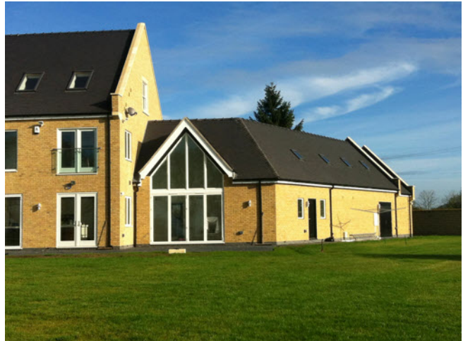
Side building and garages

ADM Systems Fairfax House, 7 Wool Gate, Cottingley Business Park, Bingley, BD16 1PE t: 01756 701051 e: info@admsystems.co.uk